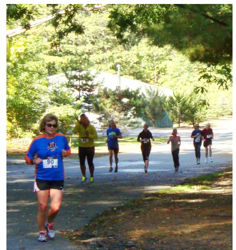
Runners approach the finish line in Slater Park, site of the Pawtucket, RI Easy as Pi race.

Registration for both races is open on the Foundation website: www.woodardcurranfoundation.org .