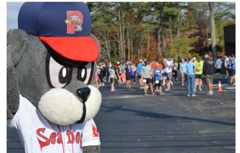
Portland Seadogs mascot, Slugger, is always a big hit at the Portland Easy as Pi race.

& Curran's Portland office, "so we decided to move it to take place before school starts." The Foundation is extremely grateful to Channel 8 WMTW (see "Sponsor Spotlight" in this issue) for again serving as the race's media sponsor, and Portland Seadogs' Slugger will make a return appearance.